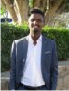
Rentals Wentworthville 0410325558