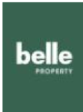
Property Management 0754487444