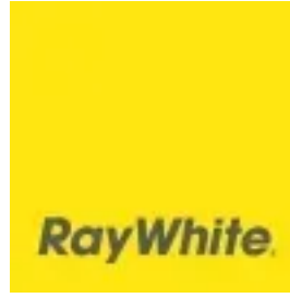
Leasing Team 0421831500