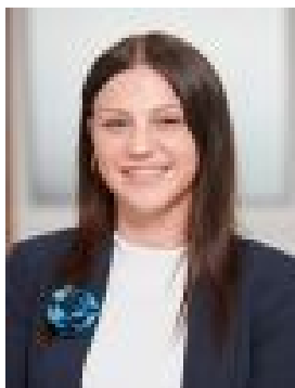
Jessica Tandy 0408502235