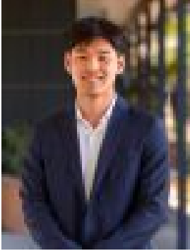
Leasing Department 0434218121