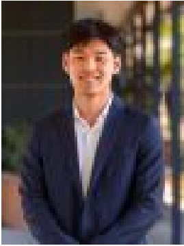
Leasing Department 0434218121